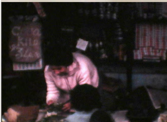
Image depicts a market stall in the Peruvian highlands where a man sells coca by the kilo to locals. Circa 1960.